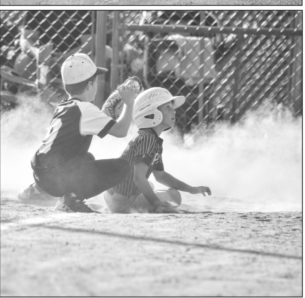
Lumpkin County from June 9-12.